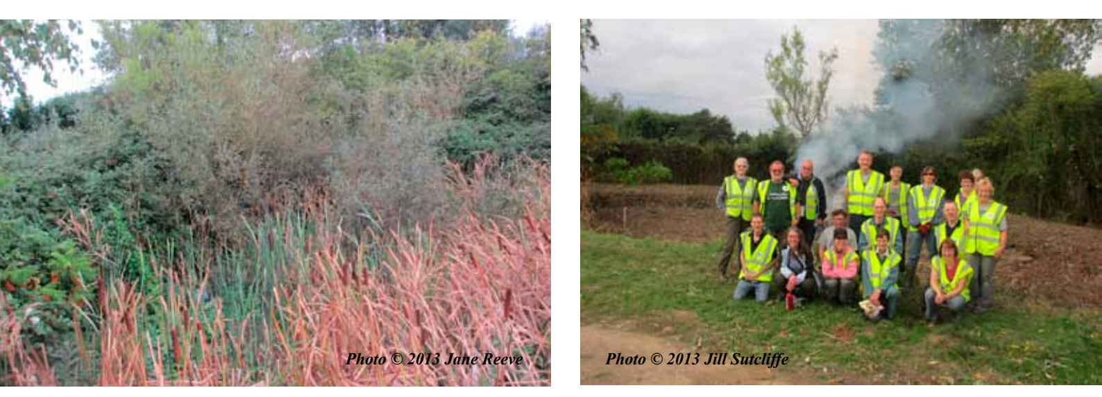
Bushells Farm Pond before

Bushell's farm pond had not been touched in 30 years and couldn't really be seen: