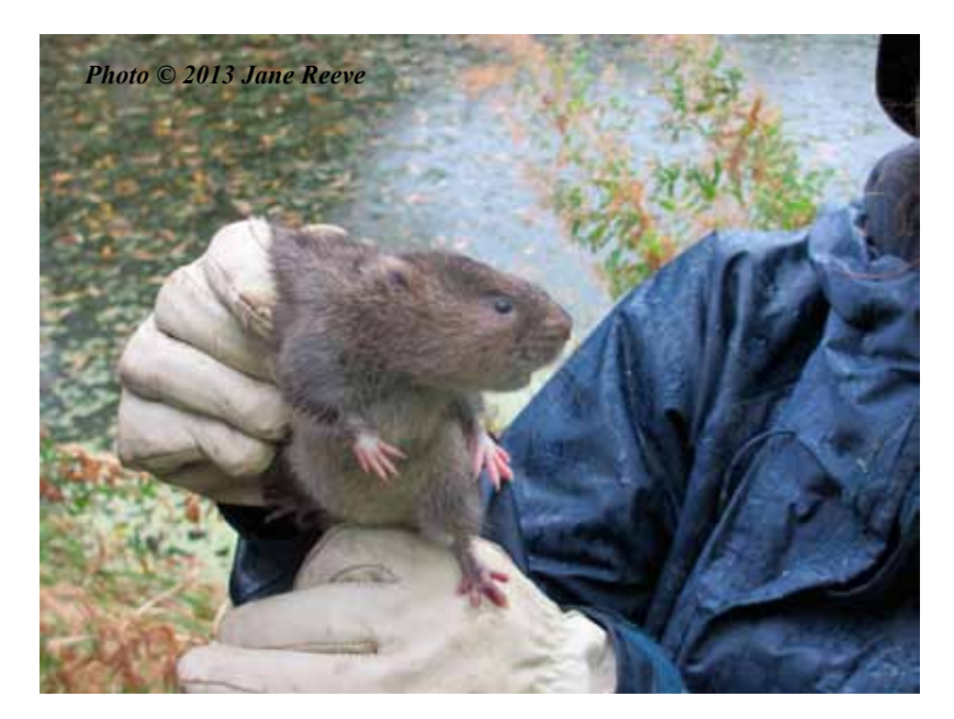
One outraged water vole

October was a busy month with water vole trapping at Chichester Canal as well. Rowenna Baker and Peter King brought along 50 traps which we helped to set out for her field work. Water voles were more elusive this year and more difficult to catch. This may be due to the lower water levels in the canal, the rather overstrimmed banks of the canal and the invasive pond weed in the water. We did eventually get 7 water voles but this number is far less than previous sessions when we have caught 22 or more. It has been a tough summer for water voles on the peninsula as many of the waterways and ponds dried up. Water voles will either move to wetter areas or retreat into their burrows and wait for water to return. They are at risk from predators, especially mink, at this time so keeping these invasive hunters off the peninsula is increasingly important.