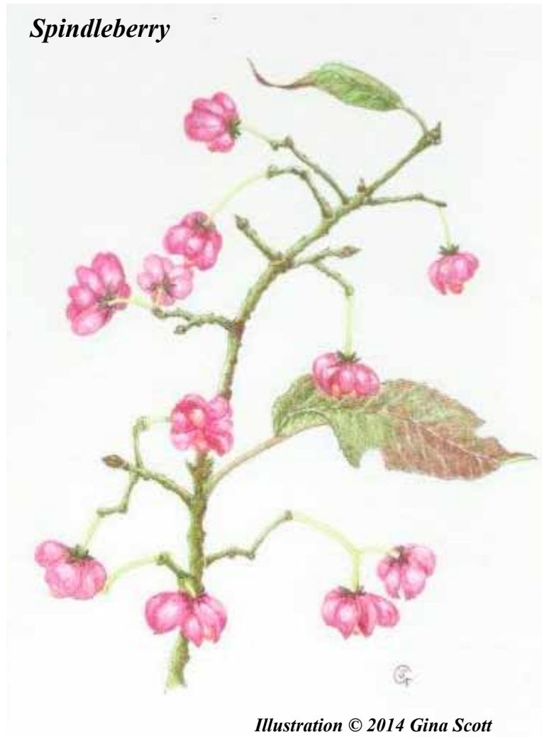
Illustration © 2014 Gina Scott