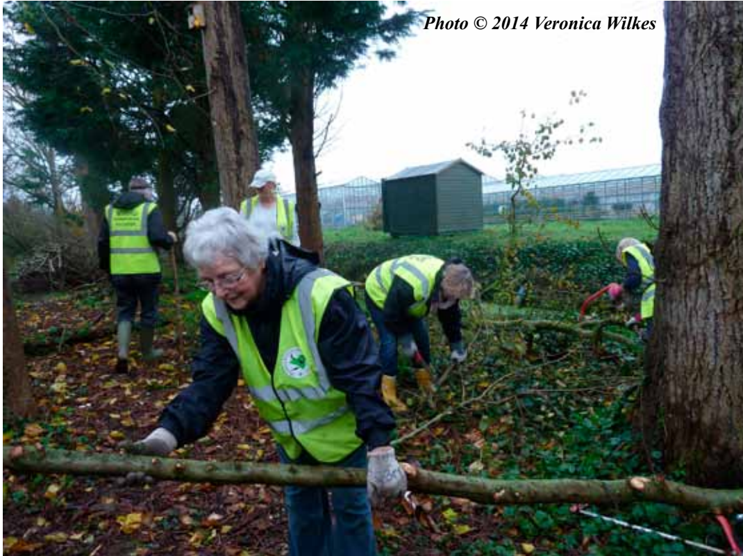
Working at Morgan's Pond