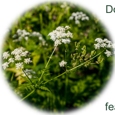
Hemlock water dropwort

This pond takes water from a large catchment area. Overtime, it filled with silt and was inadequate as a flood defence, because it could not take in lots of rainwater. The exit weir on the other side of the lane was lowered to allow more water to gush through quickly.